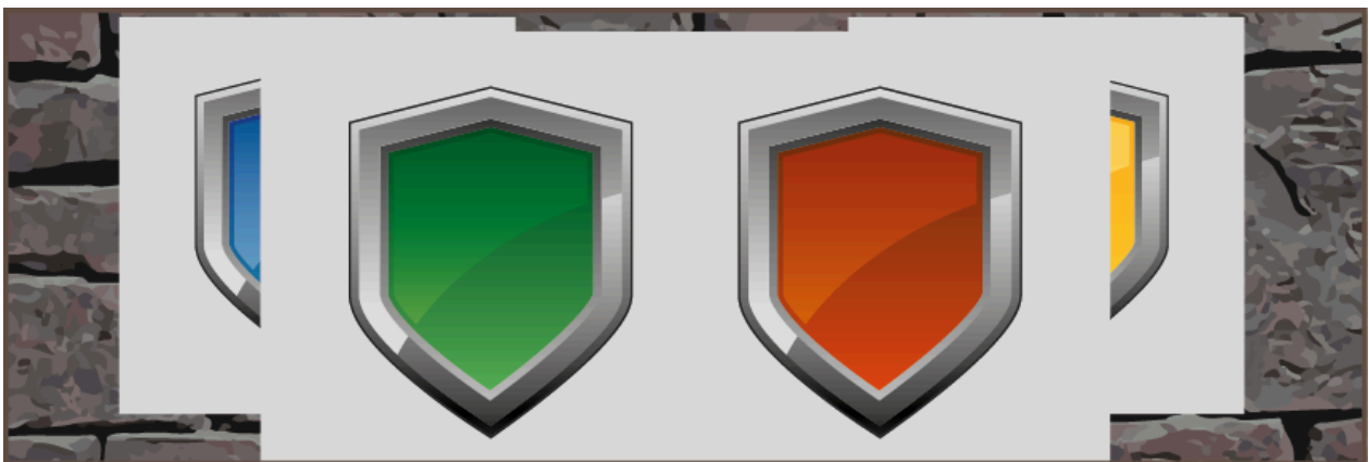
Figure 4-1: Mali Shield Scene

You can see that the square sprite geometry does not exactly match the shape of the opaque pixels. The transparent parts of the sprites, that are closest to the camera, are not producing any color values because of the alpha test. However, the transparent parts of the sprites are still setting a depth value.