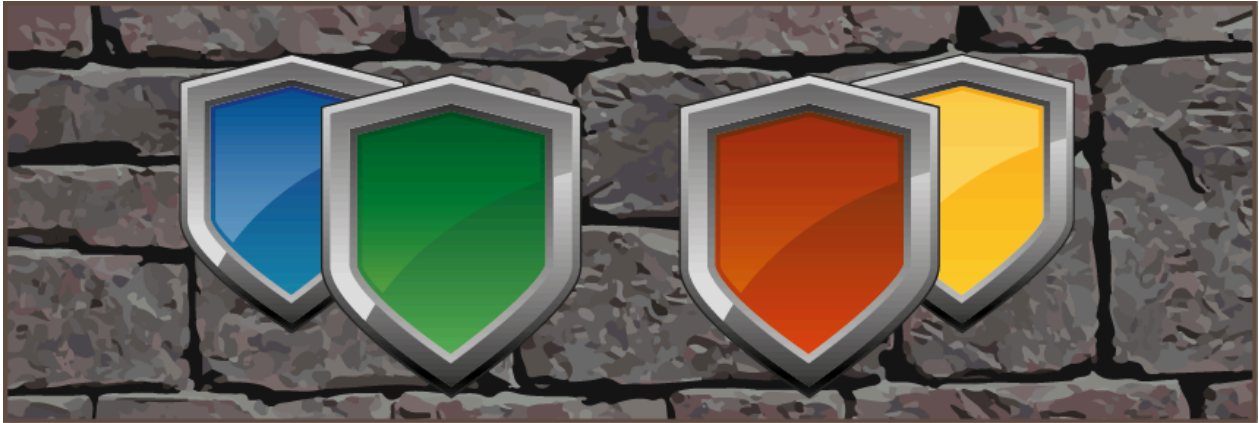
Figure 3-1: Mali Shield Scene

You can see that each shield icon is a square sprite that uses alpha transparencies to hide the pieces that are not visible.