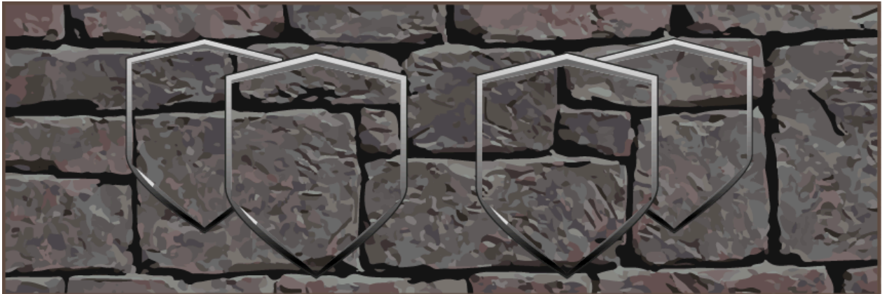
Figure 6-2: Mali Shield Scene

Areas in which one of the outer rings is obscured indicates where rendering work has been saved. The depth test has removed the missing parts.