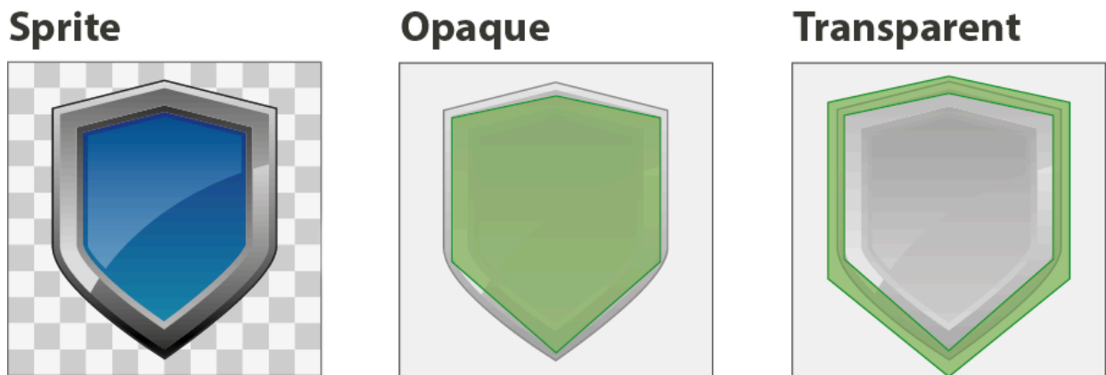
Figure 5-1: Mali Shield Scene

Vertices are computationally expensive, so use as few vertices as possible when generating these geometry sets. And while the opaque region can only contain totally opaque pixels, the transparent region can safely contain both opaque pixels and totally transparent pixels without any side-effects. This means that you can use rough approximations for a fit that you feel is good enough.