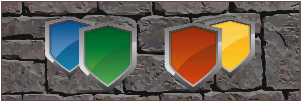
Figure 6-1: Mali Shield Scene

The renderer has not calculated or drawn the pixels for each sprite, or the part of the background, that is hidden underneath another opaque sprite. This is because the early depth test was performed before the shading calculations occurred.